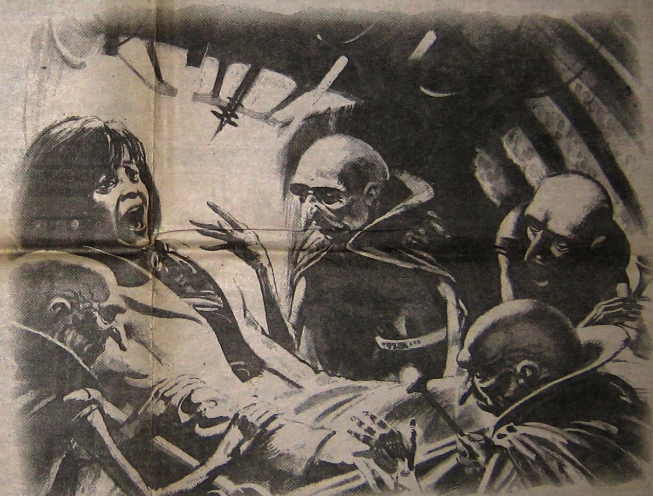
TERRIFIED... inside the UFO, the aliens strap one of their women prisoners in a reclining chair

Somehow, somewhere along that dark, deserted